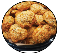
Cheddar Chive Drop Biscuits 1 dozen $18.00