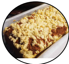
Vanilla Bean Crumb Banana Bread $18.00 / loaf

our baked goods are all handmade using local organic ingredients. In all of our breads we use our house sourdough starter, and a slow ferment gluten development process that results in organically occurring probiotics that aid in digestion and overall gut wellness.