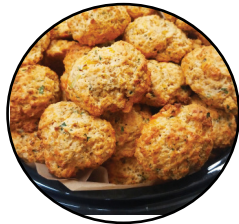
Cheddar Chive Drop Biscuits 1 dozen $18.00