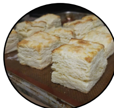
Buttermilk Biscuits 6 pc; serves 6 $12.00