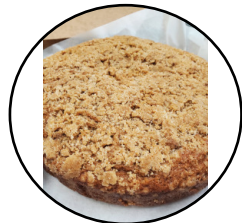
Cinnamon Coffee Cake 10 in $18.00