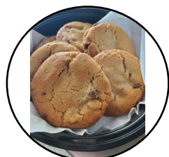
Browned Butter Chocolate Chip Cookies 6 pc; serves 6 $13.00