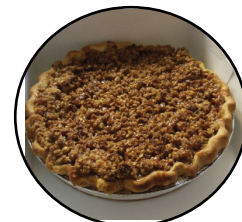
Dutch Crunch Apple Pie 9 in; serves 6-10 $20.00