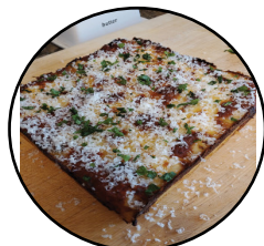
Tomato-Basil Pan Pizza 9 in; serves 6-9 $20.00